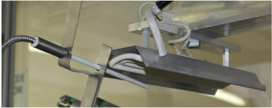
Figure 1: Experimental layout